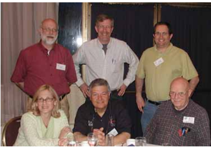
The PACKRAT banquet table

Their conference, like our MID-ATLANTIC CONFERENCE, started Friday evening a with Hospitality Room, meetings and a banquet on Saturday followed by a tail gate parking lot hamfest on Sunday morning with real bargins and lots of stuff for the microwave enthusiast.